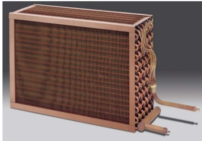
Copper – Copper Dx