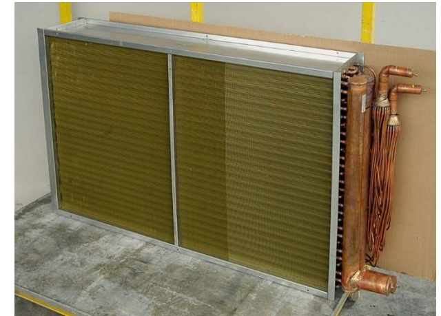
Dx Coil with Epoxy Coated Aluminium Fin and Double