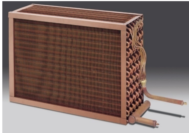
Copper – Copper Dx